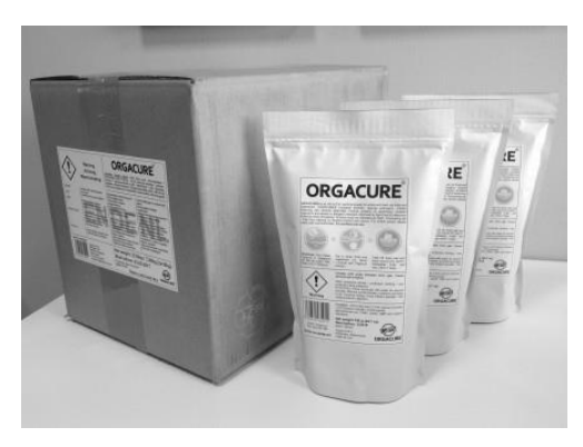
Orgacure® Travelaid and Freshcut Products